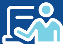
VIRTUAL INSTRUCTOR LED TRAINING (VILT)