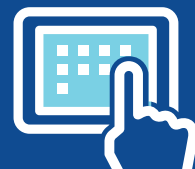
TECHNOLOGY ENABLED LEARNING